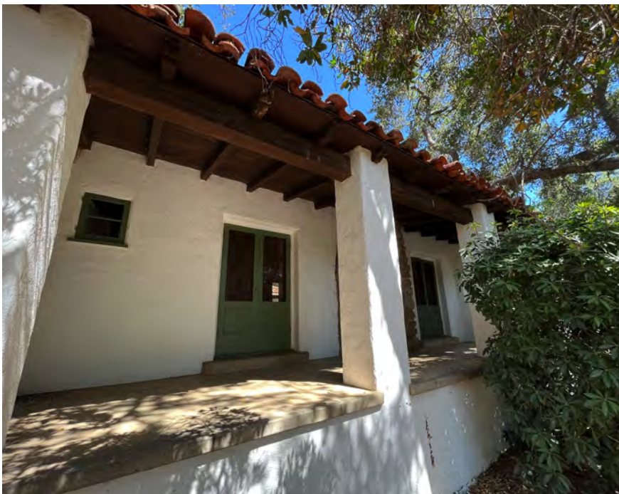
Wood Beams to Match Existing