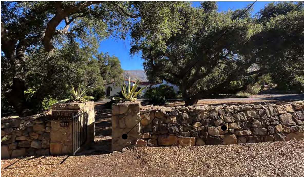
Stacked Sandstone Walls to Matched (E)