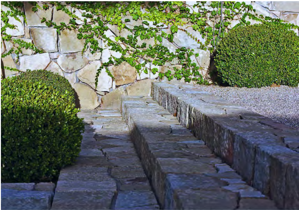
Ojai Sandstone Steps