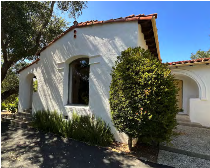
Stucco to Match Existing