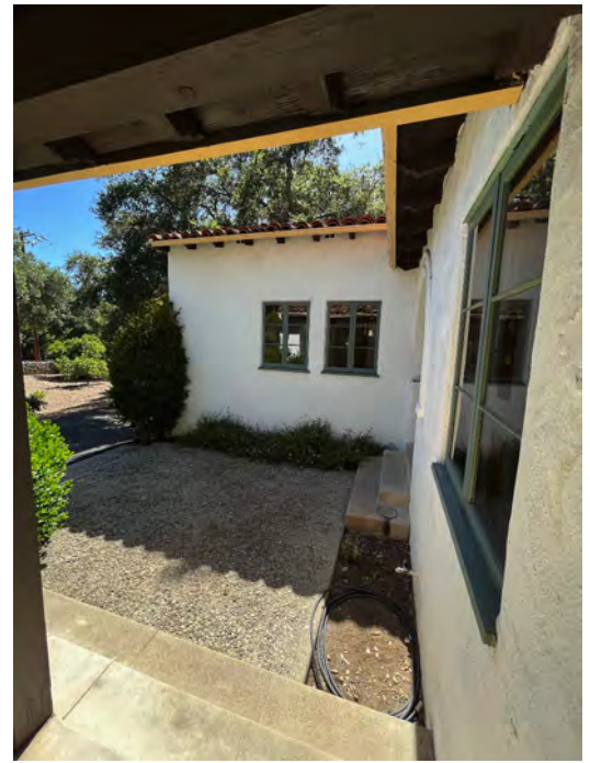
Windows to Match Existing