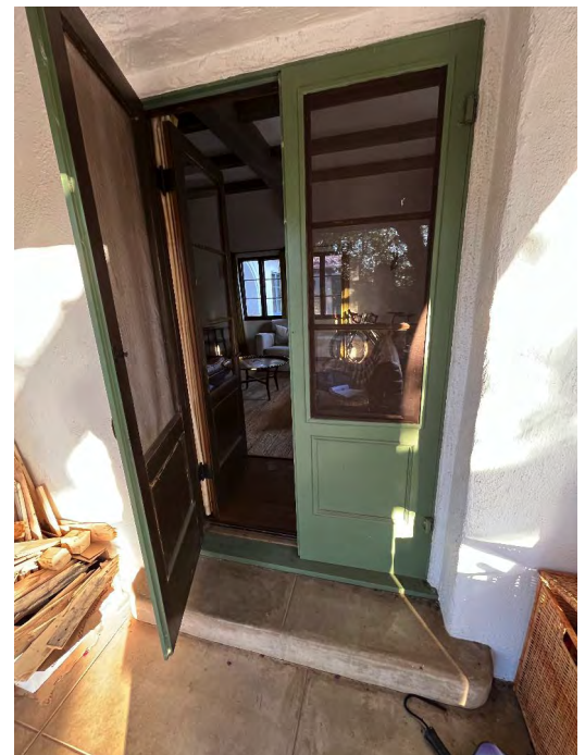
Door/Screens to Match Existing